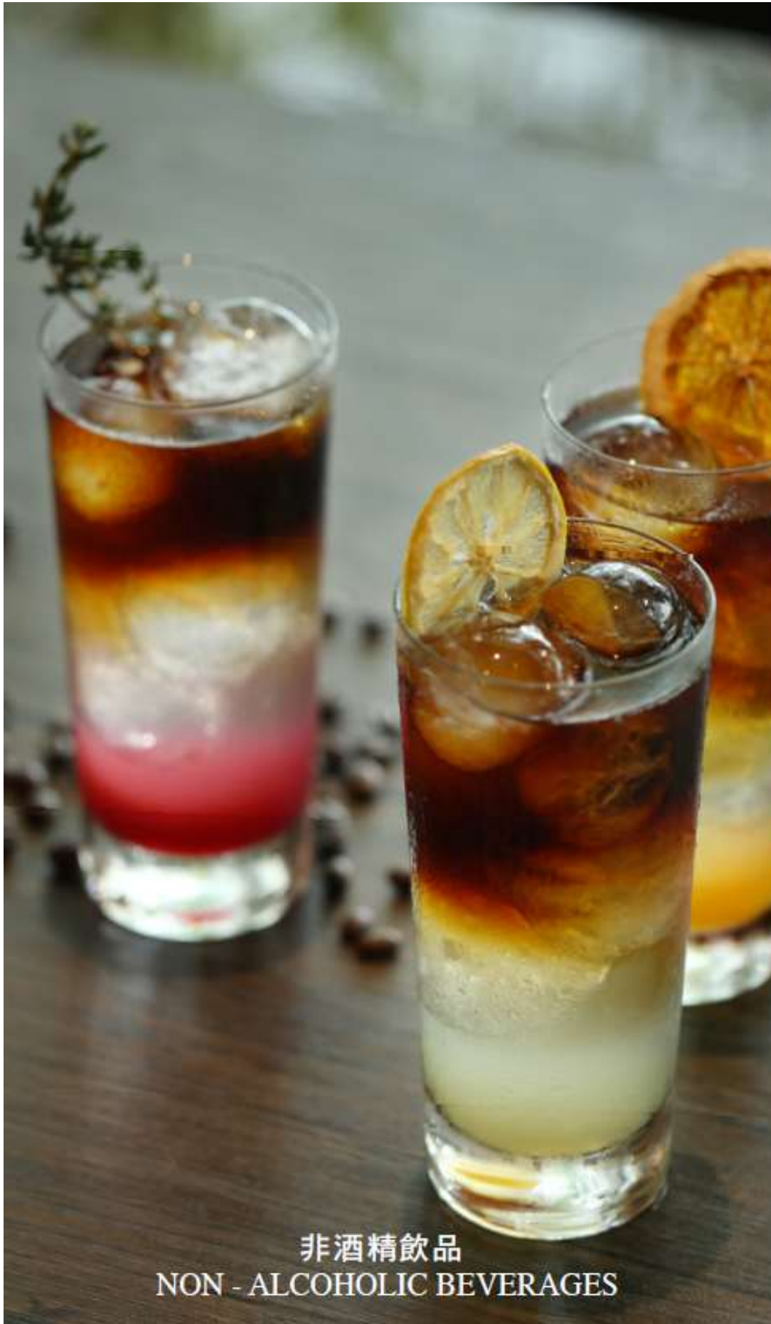
非酒精飲品 NON - ALCOHOLIC BEVERAGES