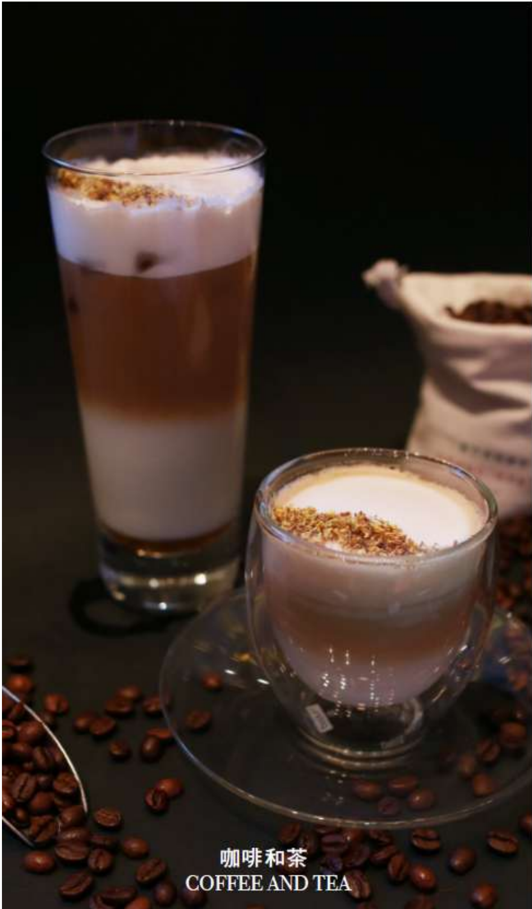
咖啡和茶 COFFEE AND TEA