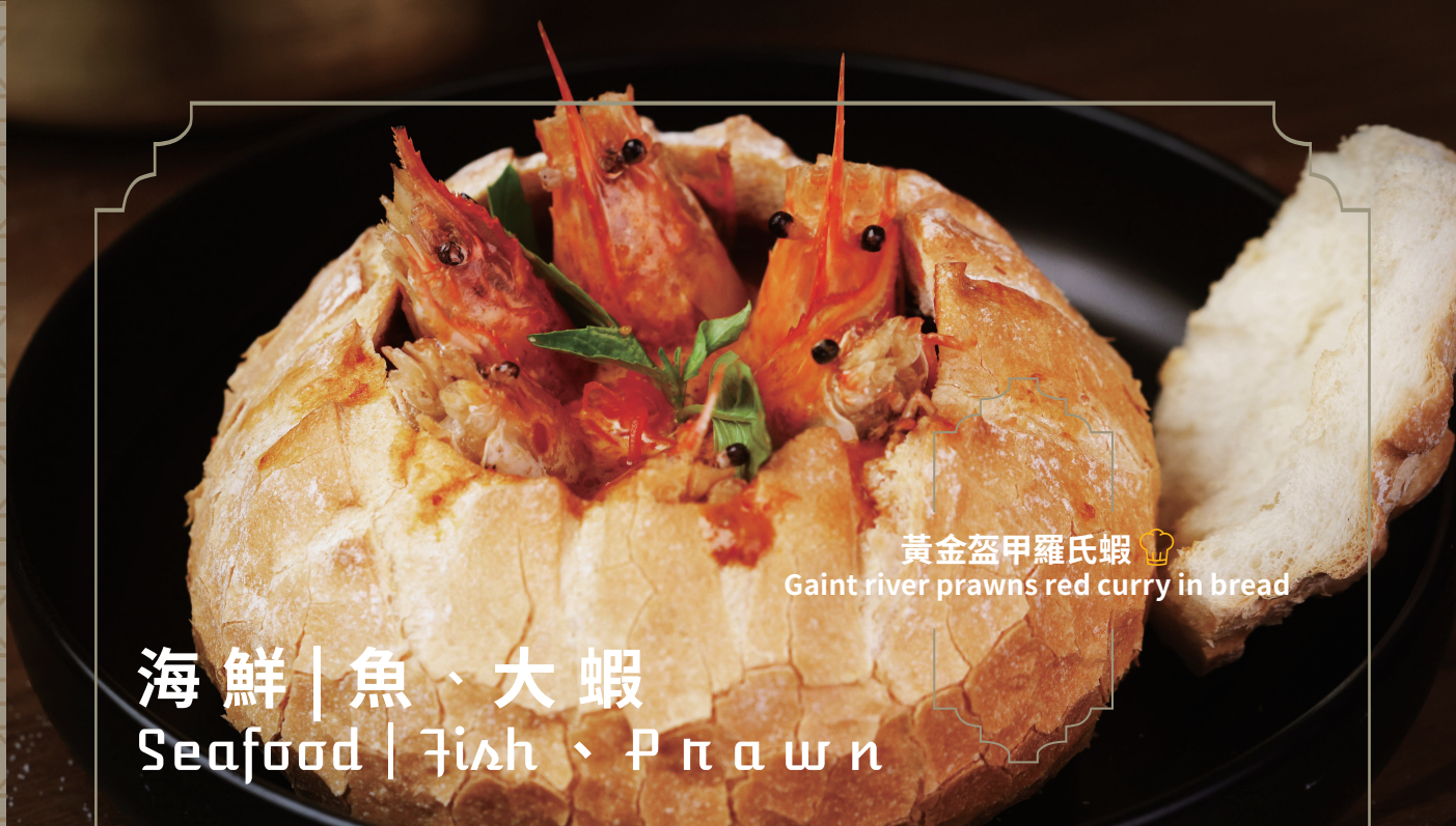
黃金盃甲羅氏蝦 🍷 Gaint river prawns red curry in bread