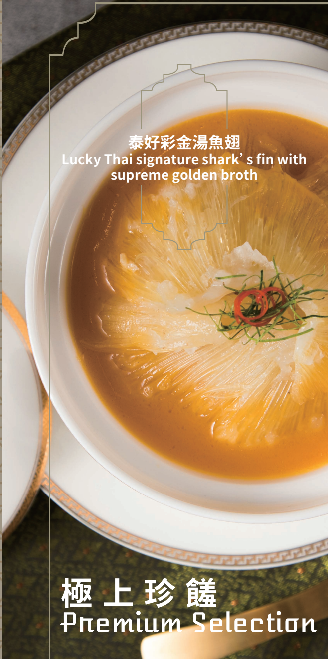
泰好彩金湯魚翅 Lucky Thai signature shark's fin with supreme golden broth