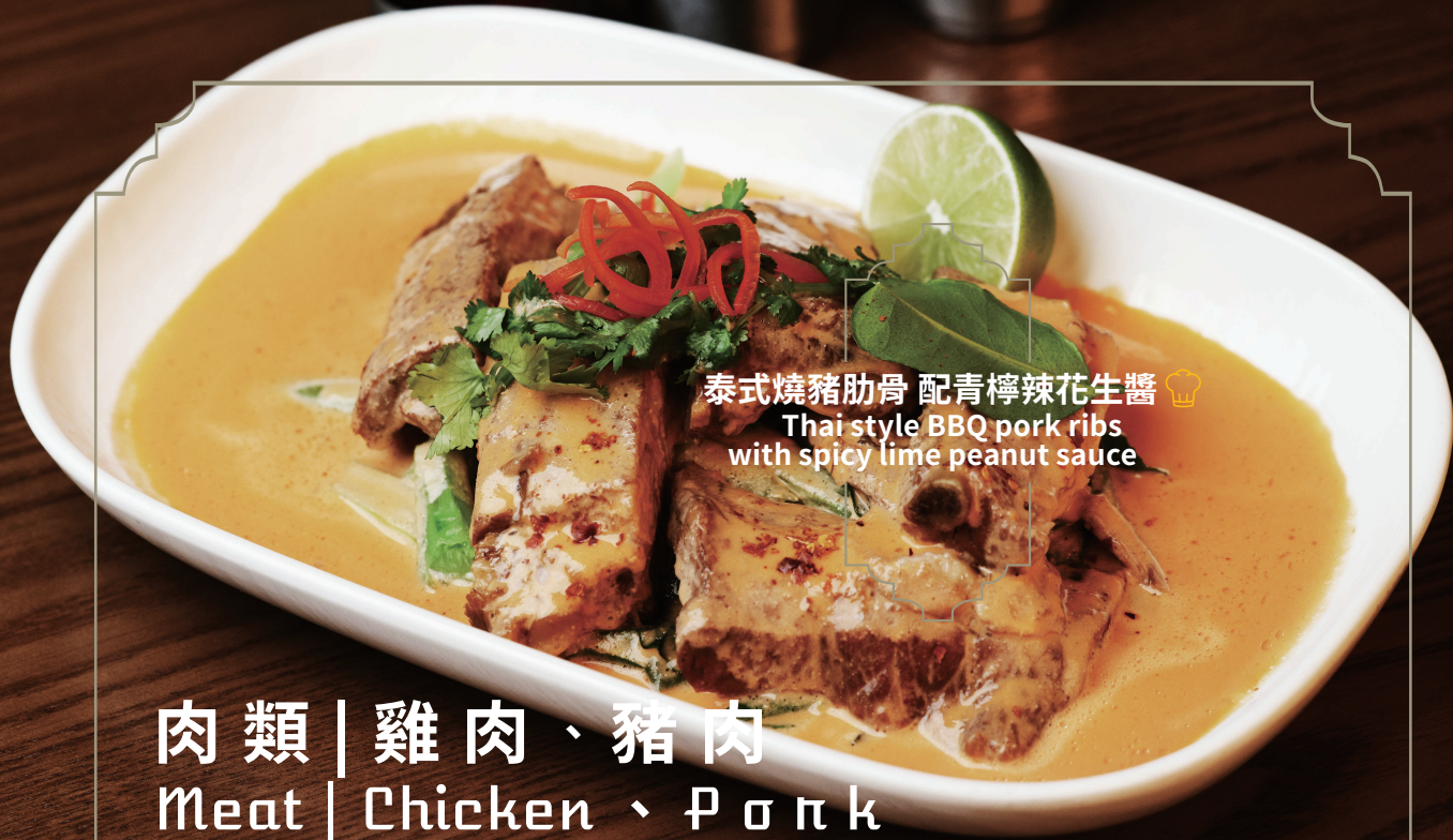
泰式燒豬肋骨 配青檸辣花生醬 🍽️ Thai style BBQ pork ribs with spicy lime peanut sauce