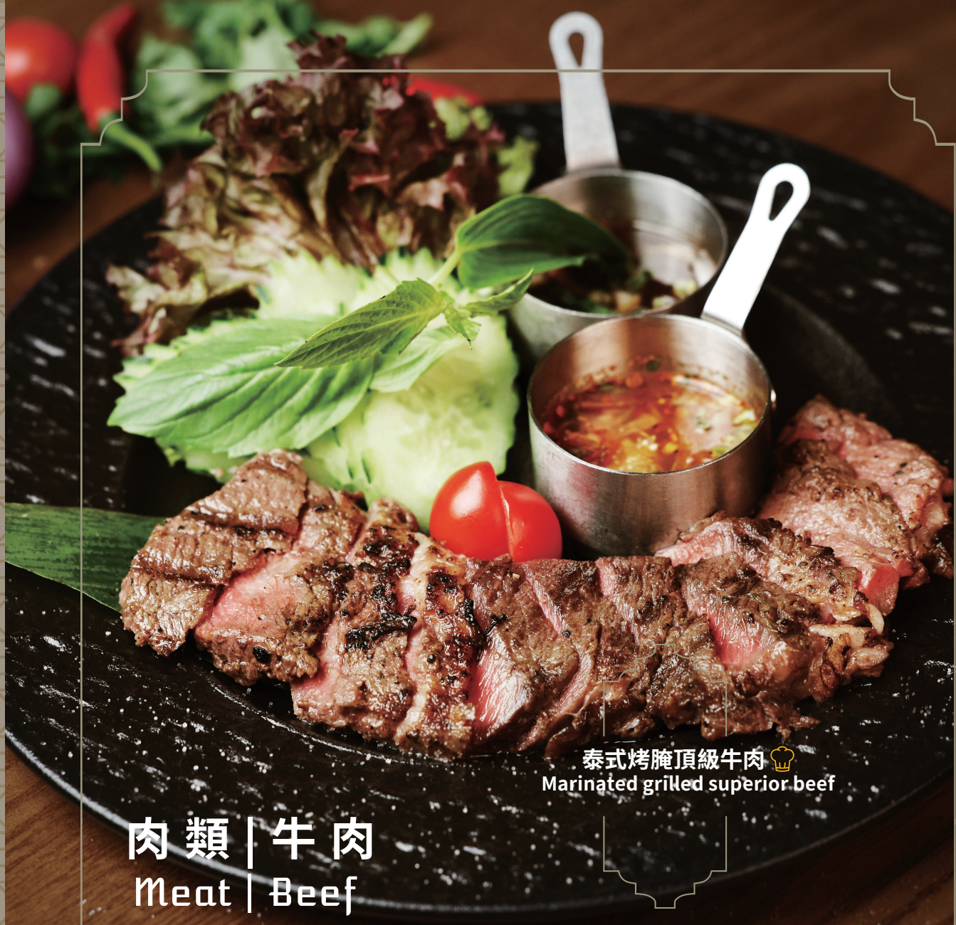
泰式烤腌頂級牛肉 🍳 Marinated grilled superior beef