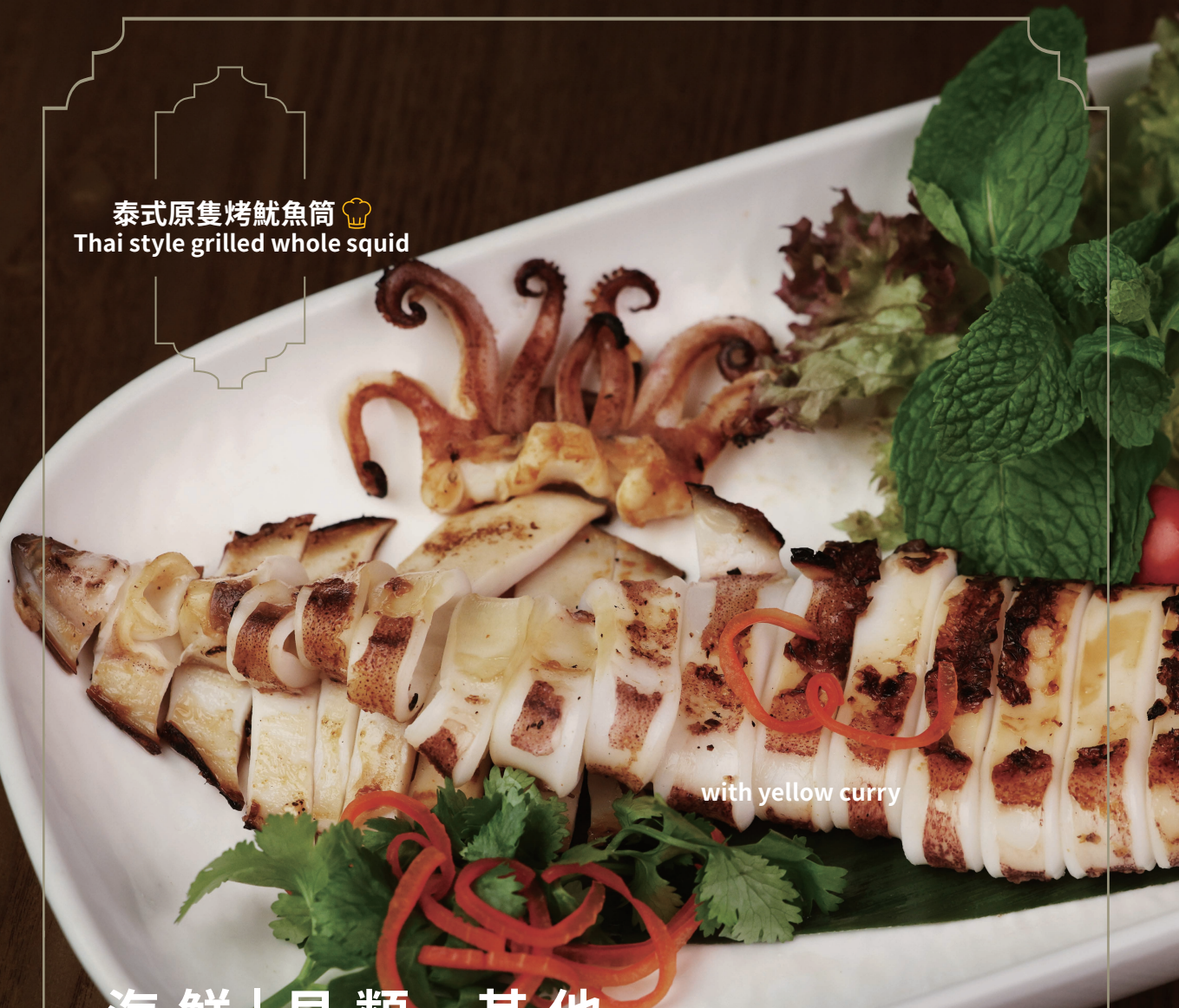
with yellow curry