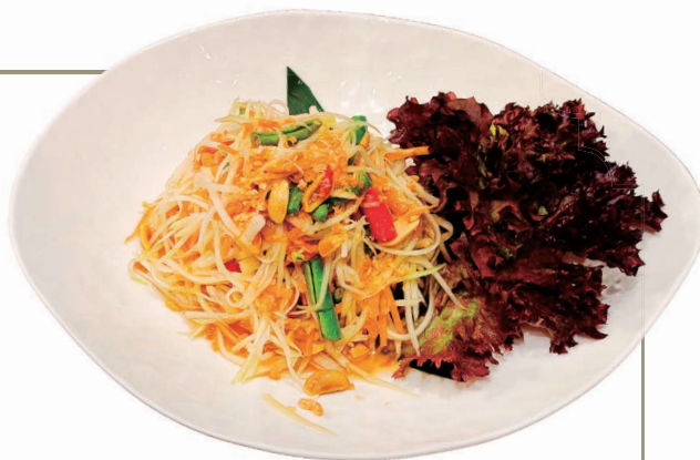
青木瓜沙律 Green papaya salad