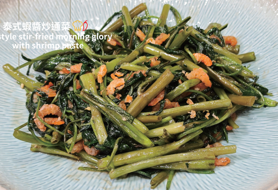
泰式蝦醬炒通菜 🍲 Thai style stir-fried morning glory with shrimp paste