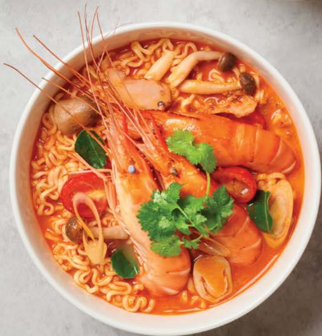
冬荫功海鲜汤面 Tom Yum Kung Seafood Noodles in Soup MOP 138