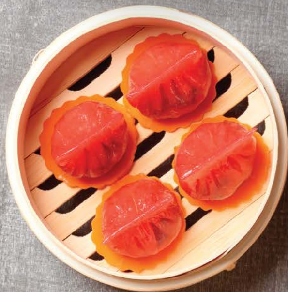
小榄西施蒸粉粿 Steamed Pork and Peanut Dumplings MOP 68