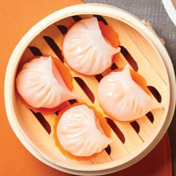
水晶鲜虾饺 Steamed Shrimp Dumplings MOP 78