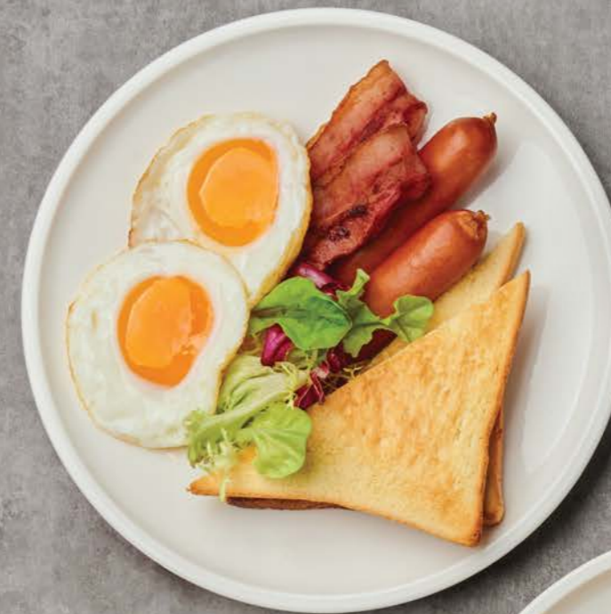
烟肉肠仔煎双蛋配多士 Fried Two Eggs with Bacon, Sausage and Toast MOP 118

薄脆奶盖南瓜西多士 68 French Toast with Condensed Milk