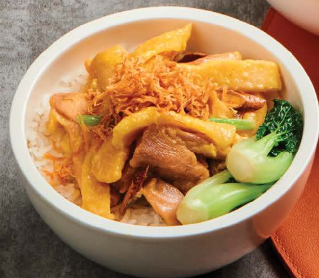
五指毛桃瑶柱蒸鸡饭 Steamed Rice with Chicken, Conpoy and Hairy Figs MOP 108

鹿茸菌龙虾蒸饭 498 Steamed Rice with Lobster and Antler Mushroom