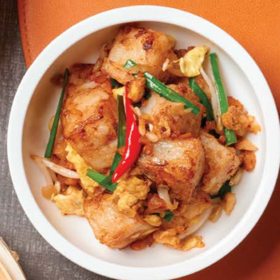
泰式XO酱炒萝卜糕 Thai Style Stir-fried Turnip Cake with XO Sauce MOP 58