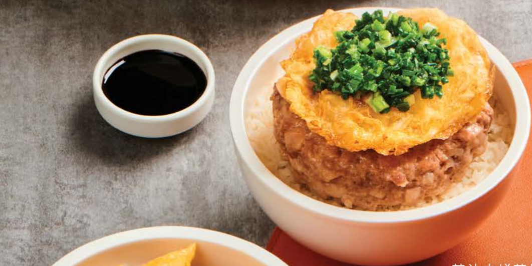
葱油肉饼蒸饭 Steamed Rice with Pork Patty and Scallion Oil MOP 108