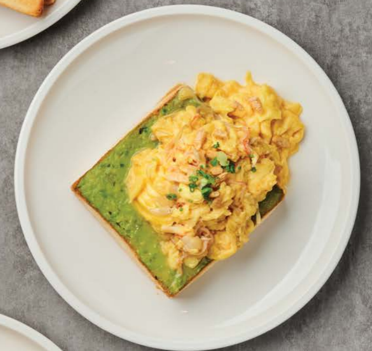
蟹柳滑蛋牛油果多士 Scrambled Eggs with Crab Meat and Avocado Paste on Toast MOP 78