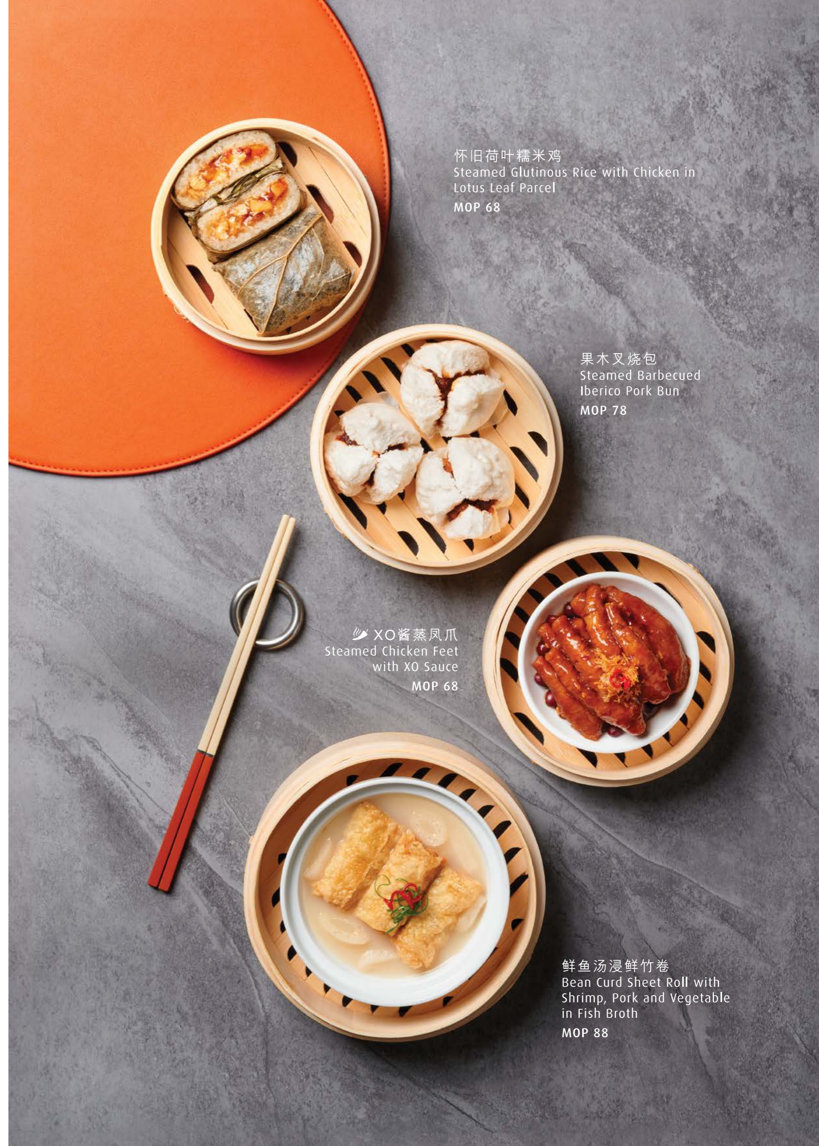
怀旧荷叶糯米鸡 Steamed Glutinous Rice with Chicken in Lotus Leaf Parcel MOP 68

请告知您的服务员关于任何食物过敏或餐饮限制。所有价格为澳门币并需加10%服务费。图片只供参考之用。 Please inform our service staff if you have any food allergies or dietary requirements. All prices are in MOP and subject to a 10% service charge. Photos are for reference only.