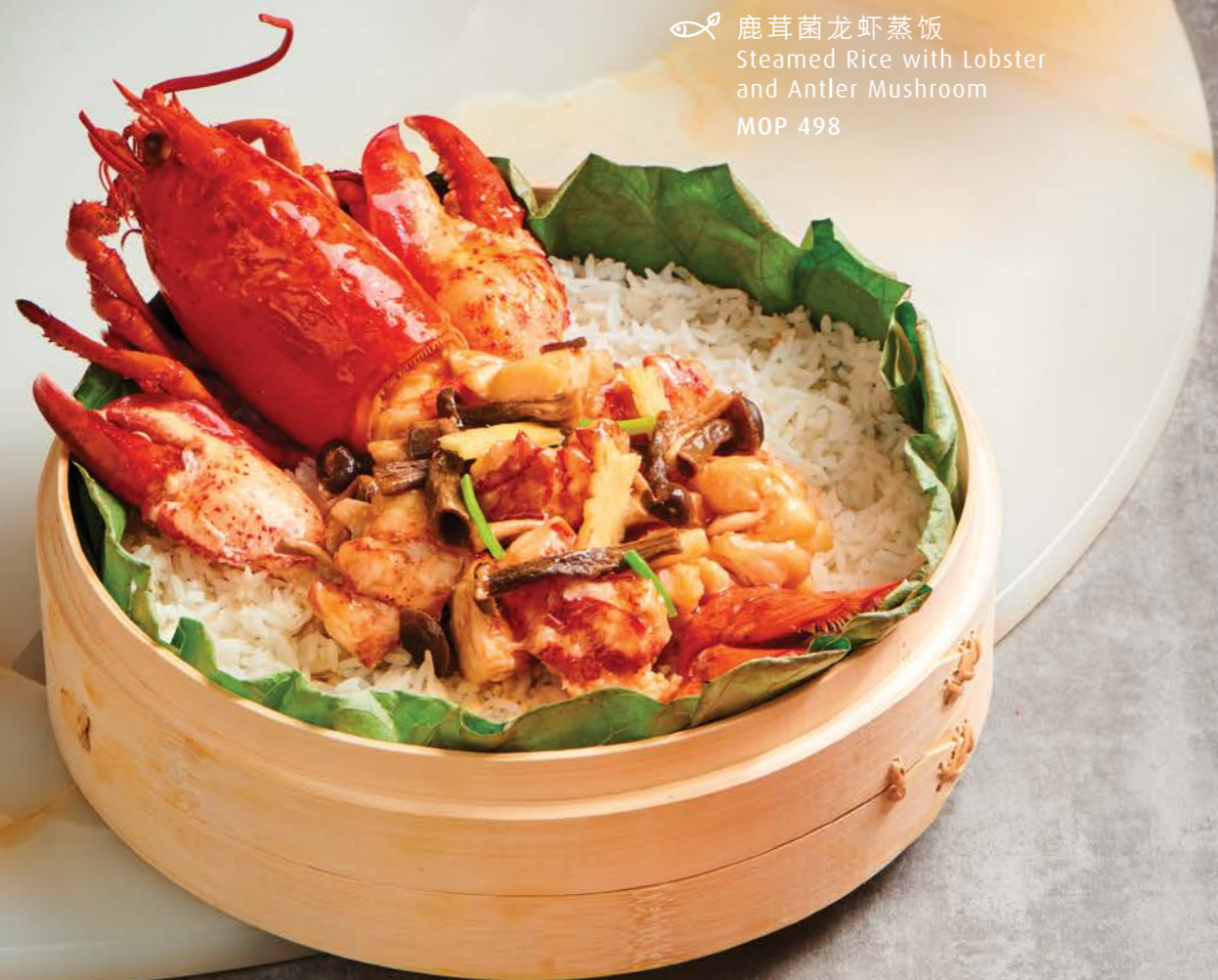
鹿茸菌龙虾蒸饭 Steamed Rice with Lobster and Antler Mushroom MOP 498