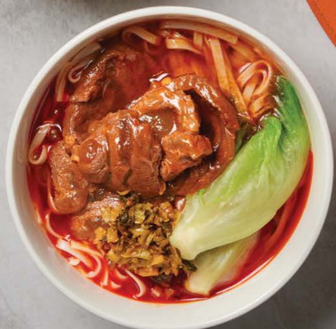
台湾渡口牛肉面 Taiwanese Style Beef Noodles in Soup MOP 128

米酒鸡汤米线 138 Poached Rice Noodles with Chicken and Cordyceps Flowers in Rice Wine