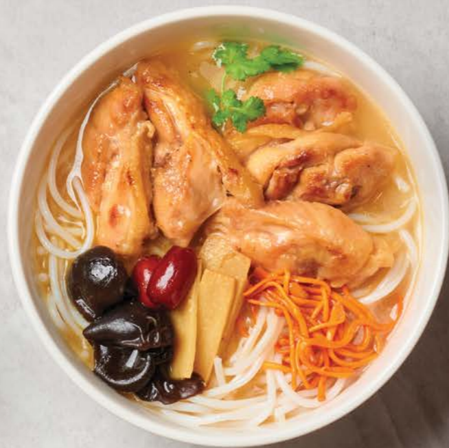
米酒鸡汤米线 Poached Rice Noodles with Chicken and Cordyceps Flowers in Rice Wine MOP 138