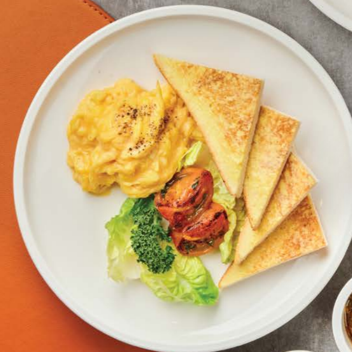
炒滑蛋配鸳鸯辣鱼酱多士 Scrambled Eggs on Toast with Duo Spicy Sardine Spread MOP 118